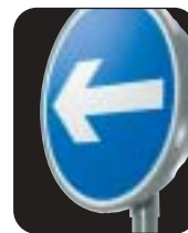
Box Signs 11